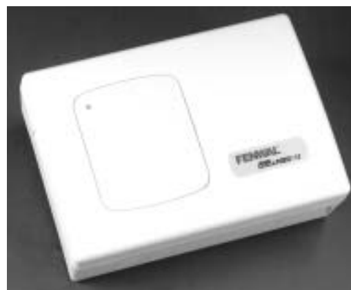
Figure 2. AnaLASER II Detector