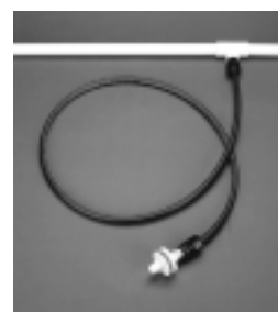
Figure 5. Sampling Point with Capillary Tube