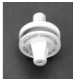
Figure 4. Sampling Point

The AnaLASER II product line offers an array of air sampling network accessories such as a sampling point, capillary tube rolls, sampling point, port and pipe labels.