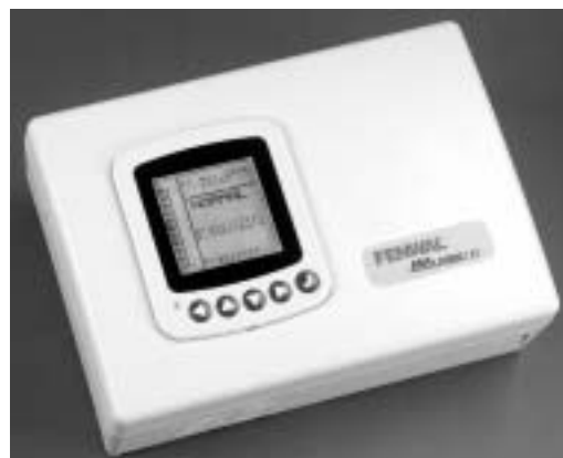
Figure 1. AnaLASER II Detector with Optional Display Module